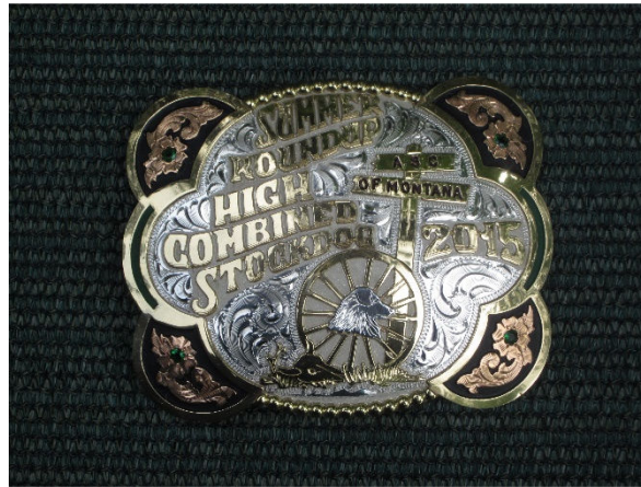
ASCA® Sanction Pending

Tracking forms and service membership applications are available at: www.asca.org . Choose link to forms and rulebooks . Entry forms are also available there.